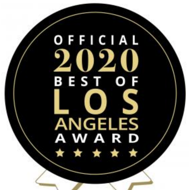
Best of LA Award